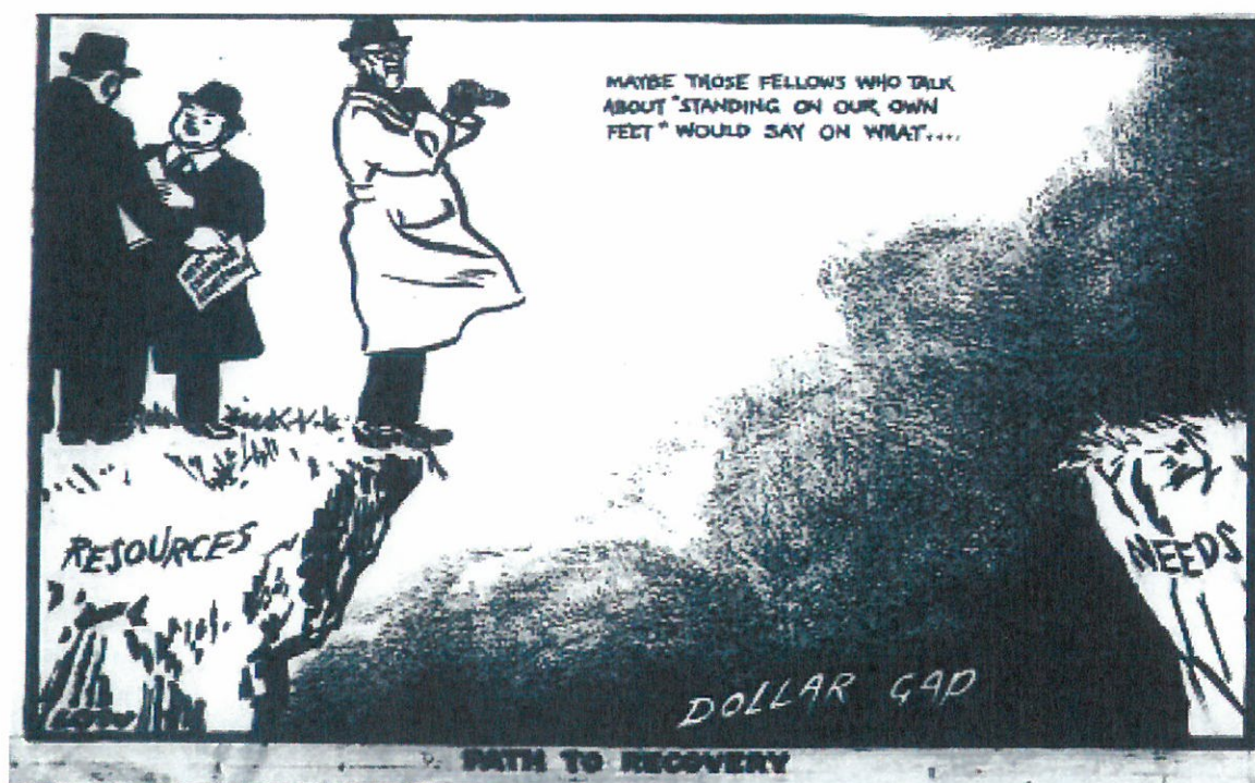
PATH TO RECOVERY A cartoon by David Low in the London newspaper Evening Standard 21 January 1948

The paper in the man's hand bears the words 'NEXT CANADIAN AGREEMENT'.